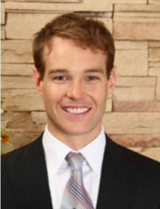
Demo Agent (WPCasa)

Duis mollis, est non commodo luctus, nisi erat porttitor ligula, eget lacinia odio sem nec elit. Lorem ipsum dolor sit amet, consectetur adipiscing elit. Donec ullamcorper nulla non metus auctor fringilla.